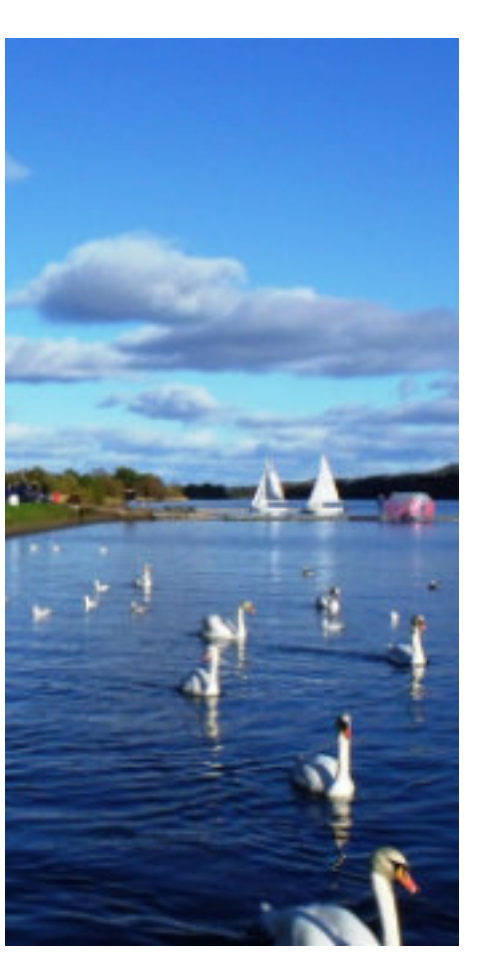
Castle Semple Watersports Centre Website Link

Ayrshire North is a wonderful county full of activities outside the site, if you are staying for more than weekend here are some options available; (All transport to be arranged)