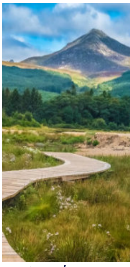
Isle Of Arran / Isle of Cumbrae Ferry Website Link