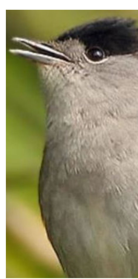
RSPB Lochwinnoch Website Link